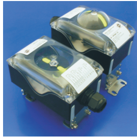
Model EPE (S. 2)