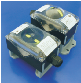
Model EPP (S. 1)