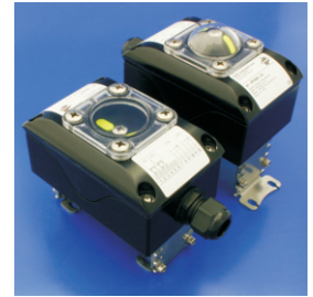
Model EAE (S. 6)