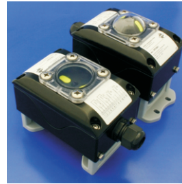
Model EAP (S. 5)