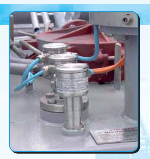
Klay Pressure transmitters on inland chemical tanker