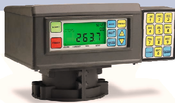
EMR 3 with optional key pad