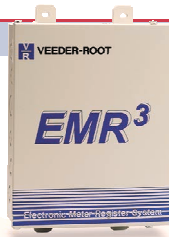
EMR 3 Interconnect box (I.B.)