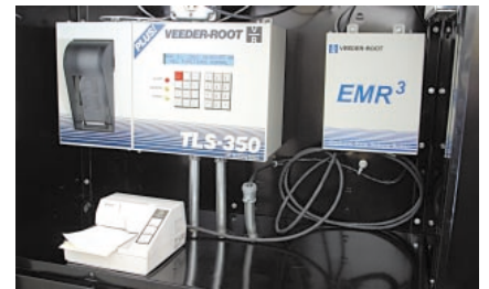
The EMR3 can be connected to any Veeder-Root TLS series automatic tank gauge for enhanced fuel monitoring capabilities.

non-volatile memory capability in the EMR 3 . The I.B. unit continuously stores data for the last 200 transactions. All EMR 3 systems include three communication ports, intended for connection with vehicle On-board computers, Delivery Ticket Printers, I.B.net, or other auxiliary devices. Many leading back-office software providers rely on the EMR 3 as a key component in their fuel-solution offerings, using hand-held devices to transfer data from the I.B. unit to the customer's Back-office PC.