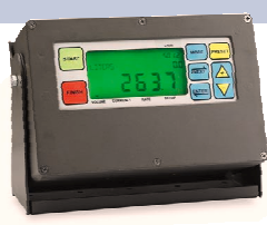
Fully functional remote register unit