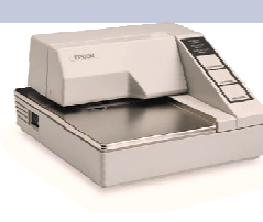
EPSON slip printer