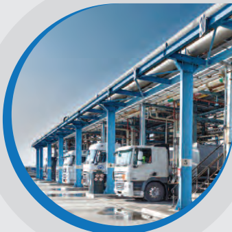
Truck loading stations