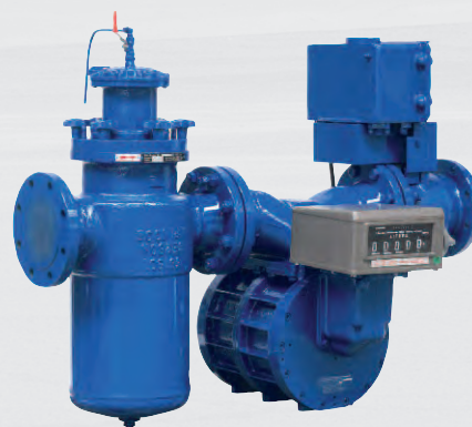
Horizontal metering system ZCE5-H