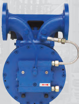
Mechanical additive injection module XAD41