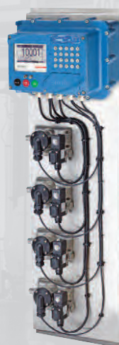
Additive injection modules with electronic controller