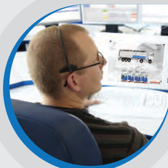
Supervision and management