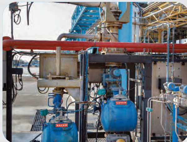
Blending system ZCE25

Satam has developed a fuels blending system allowing full control of blended product quality and custody transfer measurements. The Equalis flow computer can manage downstream blending with 2 meters measuring the blending components, or upstream blending with one meter on one component of the blending and the second meter on the blended product. In both cases the flow computer controls the flow rate of one component using a digital control valve in order to achieve a perfectly managed blending rate. As for additive injection, a “Clean Arm” function is also built-in as standard in order to prevent any contamination between 2 successive batches.