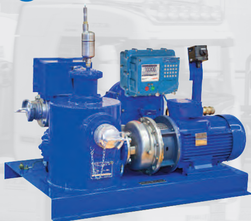
Reception unit with pump ZCE21

This reception unit is fitted with a centrifugal pump. It is designed to empty tanks to underground or surface storage. Its built-in gas elimination device guarantees reliable volume measurements in all the unloading steps.