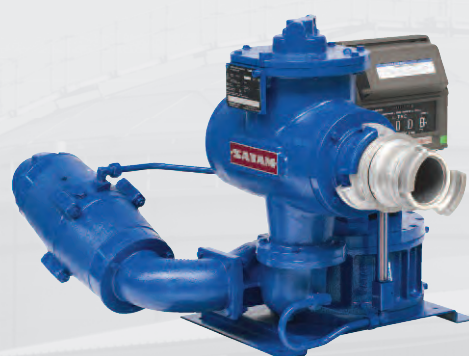
Gravity feed reception unit ZCE11-80

This measuring unit can be supplied with an electronic or mechanical register. The mechanical version is totally self-powered.