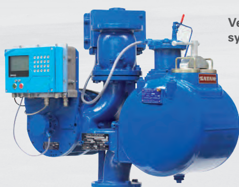
Vertical metering system ZCE5-V