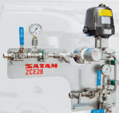
Additive injection module ZCE28 with OIMLR117 approved meter