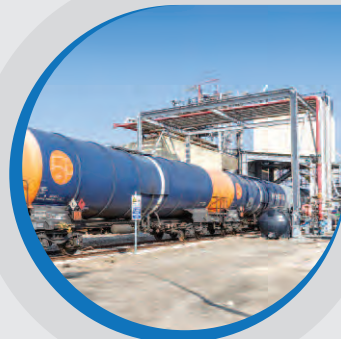
Rail car loading stations